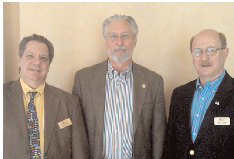
Spring Meeting • Napa, CA The Appraisal Foundation (TAF)