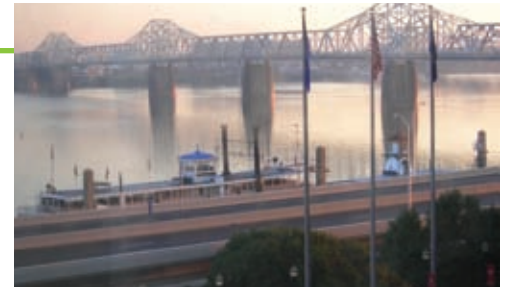
View from the Galt House in Louisville