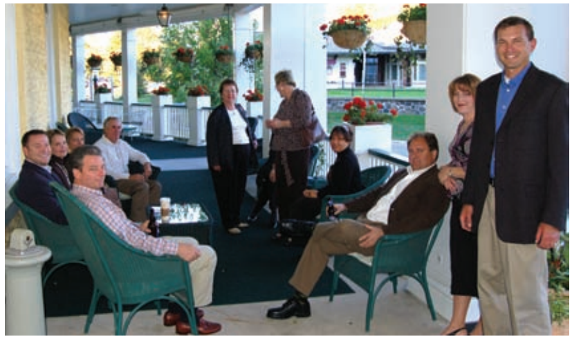
Above: Some Chapter 7 members enjoy the lovely weather and socialize on the porch at the Perry Hotel in Petosky just prior to Dinner at Stafford's