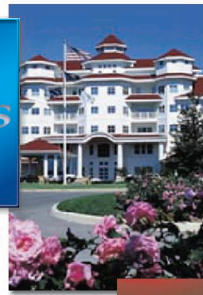
Inn at Bay Harbor